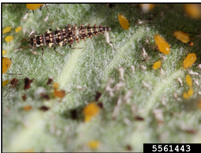
Figure 3: Green lacewing larva feeding on aphids

Lacewing larvae look like tiny alligators. They are voracious predators of soft-bodied insects. Each larva has a pair of large sickle-shaped mandibles. Larva uses the mandibles to pierce the body of its prey and suck the body fluids. They are very active individuals and fast runners. The larvae can move more than 100 feet when searching for prey. There are three larval stages in lacewing lifecycle. At end of first or second larval stage, each larva sheds the old skin and become the second or third larva, respectively. At the latter part of its development, the third stage larva weaves a round silken cocoon to pupate.