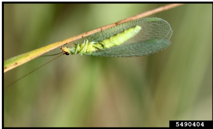
Figure 1: Green lacewing adult.

Natural enemies such as green lacewings (Neuroptera: Chrysopidae) are important for sustainable agriculture because they provide us a free service in managing and controlling unwanted insect and mite (arthropod) pests in agricultural crops in fields and greenhouses. Green lacewings are predators of many soft-bodied insects (e.g. aphids, thrips, mealybugs, soft scales, whiteflies, psyllids and small caterpillars) and mites (e.g. spider mites) and their eggs. They are called generalist predators because they feed on many different types of insect and/or mite prey. Green lacewings are considered as one of the most important predatory natural enemies of agricultural pests.