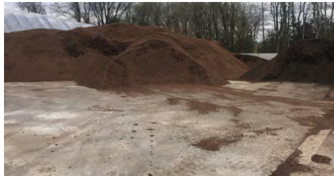
Figure 1. Properly stored pine bark substrate on a concrete pad with side walls.