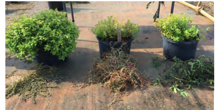
Figure 2. More frequent hand weeding (plant at far left) increases crop growth and reduces labor compared to less frequent hand weeding (two plants on right).

Growers should periodically scout for weeds in nursery containers and production areas to properly identify weed species and to select the most effective control method. Research has shown that more frequent hand weeding in nursery containers can save labor costs over time as small weeds are easier to pull compared to removing overgrown weeds. Hand weeding conducted at routine intervals (every 2-3 weeks) also reduces weed seed banks by removing weeds prior to flowering and seed formation.