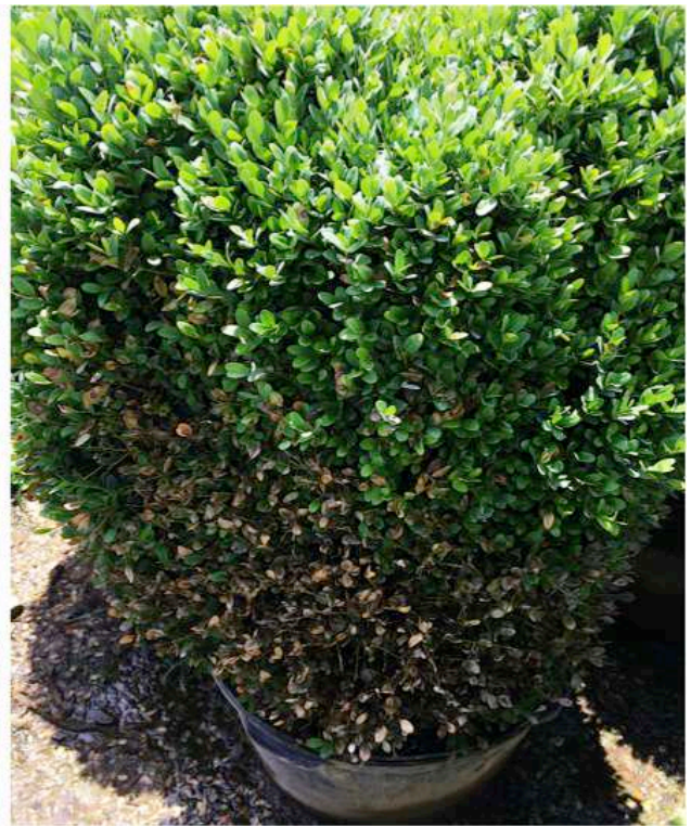
Figure 3 and 4. Leaf spots and defoliation caused by Calonectria pseudonaviculata on boxwood.