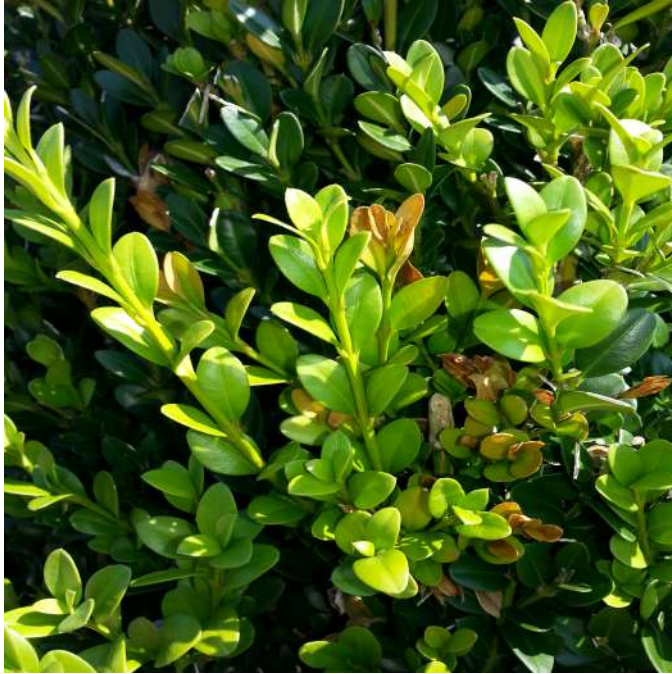
Figure 12. Abiotic disorder on boxwood.