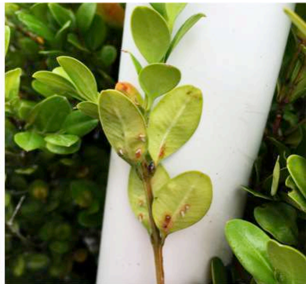
Figure 10 and 11. Boxwood leaf miner damage.