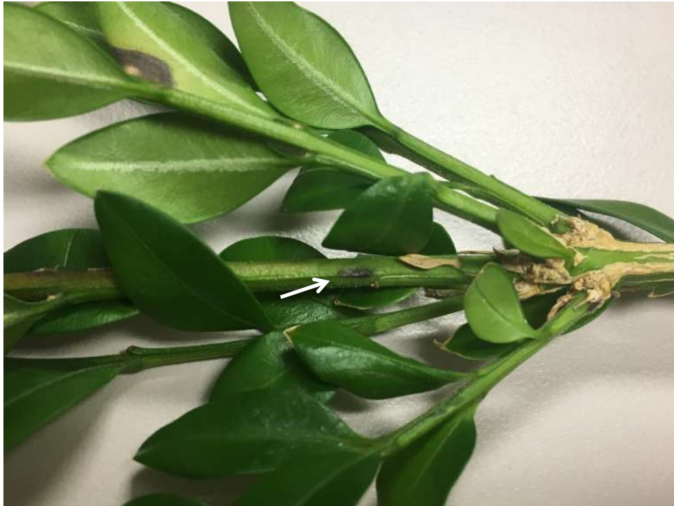
Figure 5. Black stem canker caused by Calonectria pseudonaviculata on boxwood.