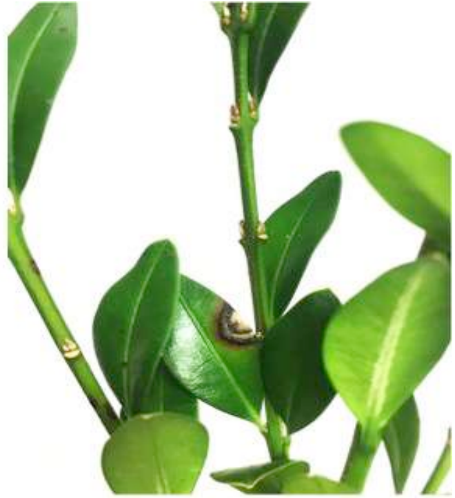
Figure 1 and 2 . Leaf spots of boxwood blight.