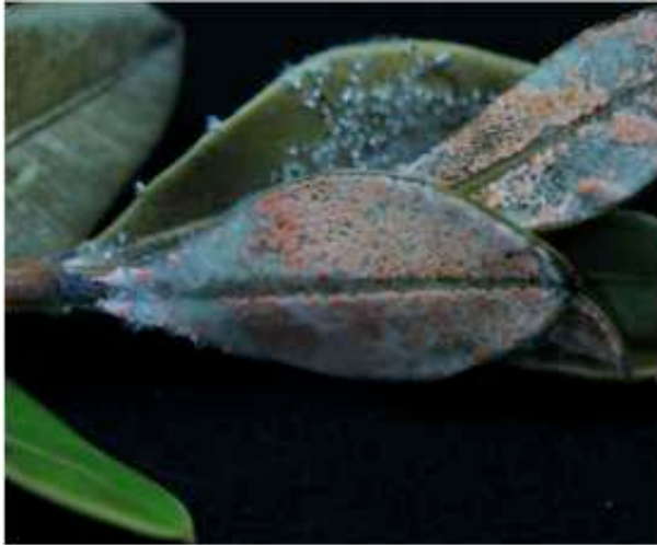
Figure 8. Volutella blight on boxwood.

The black cankers or streaks develop on the green stems of the boxwood blight disease infected plants (Figure 5). This is the major symptom that can be used to differentiate this disease from other boxwood diseases such as Volutella blight (Figure 8) and Macrophoma leaf spot (Figure 9); boxwood pests such as boxwood leaf miner (Figure 10 and 11); or boxwood abiotic disorders such as winter injury or sunscald (Figure 12).