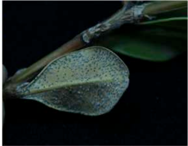
Figure 9. Macrophoma leaf spot on boxwood.