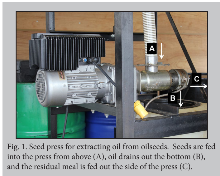
Fig. 1. Seed press for extracting oil from oilseeds. Seeds are fed into the press from above (A), oil drains out the bottom (B), and the residual meal is fed out the side of the press (C).

Seed press: A seed press (Fig. 1) will allow for the extraction of oil from a number of different types of seeds. Prices usually range $3,000 - $12,000 depending on the manufacturer and the processing volume/speed. In addition to oil, the press also produces residual meal that can be used as an animal feed.