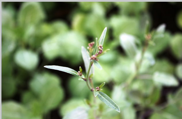
Fig. 1 Carinata starting to bloom in January 8th at the TSU AREC in Ashland City, TN.

In 2015 and 2016, carinata was planted at the Tennessee State University Agricultural Research and Education Center (TSU AREC) in Ashland City, TN on October 2nd and 4th, respectively. In the first year, the plants began to bolt and produce buds in January (Fig. 1) and in the second year, though no bolting was observed, the plants did not survive the winter. According to the National Weather Service,