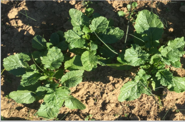
Fig. 2 Crambe on Nov. 23rd at the TSU AREC in Ashland City, TN.