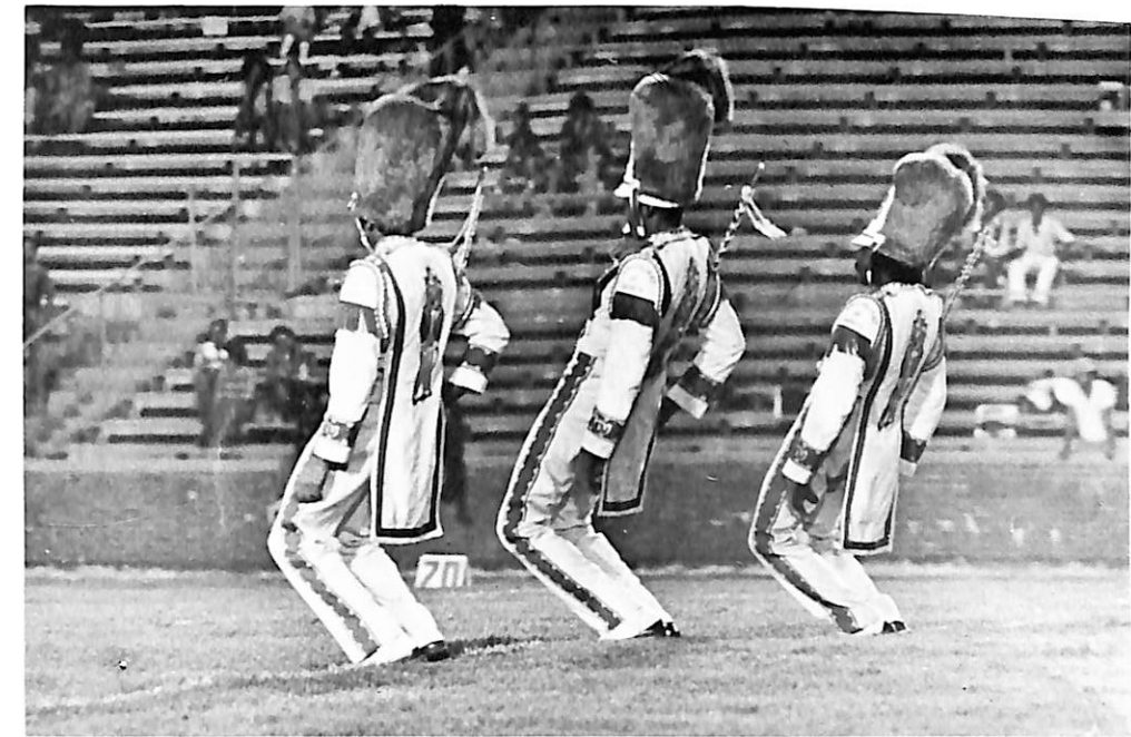
Three Drummajors Fronting the Band . . .