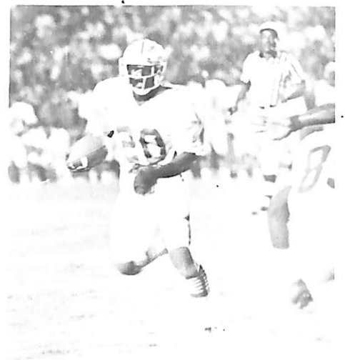
A Tiger Heading for Paydirt with the Ball . . .