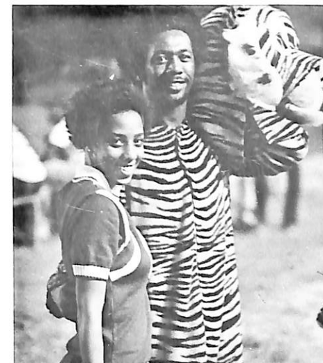
A Tiger Cheerleader without his head and talking fondly to a girl cheerleader . . .