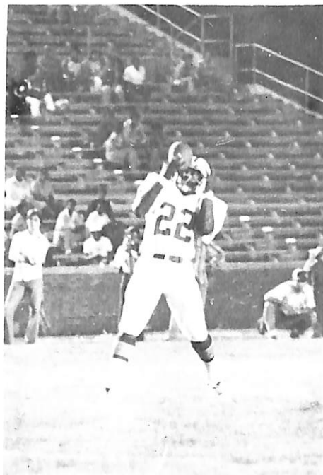
A Big Blue TSU Tiger Catching a Pass . . .