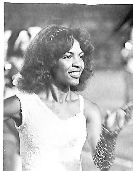
A Queen . . .