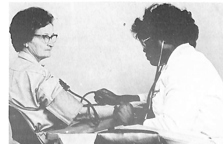
Blood pressure, sickle cell and dental examinations were a few of the tests administered during the Farm, Home, and Ministers' Institute