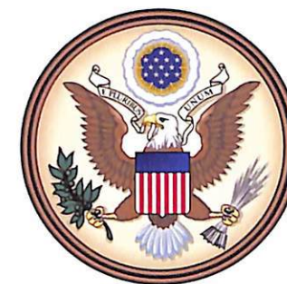
Jim Cooper Member of Congress