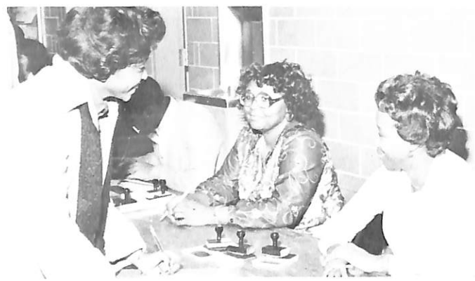
She picks up housing registration cards . . .