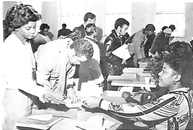
She picks up fee cards . . .