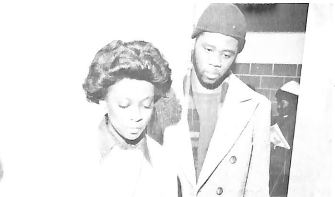
She gets final seat card checked . . .