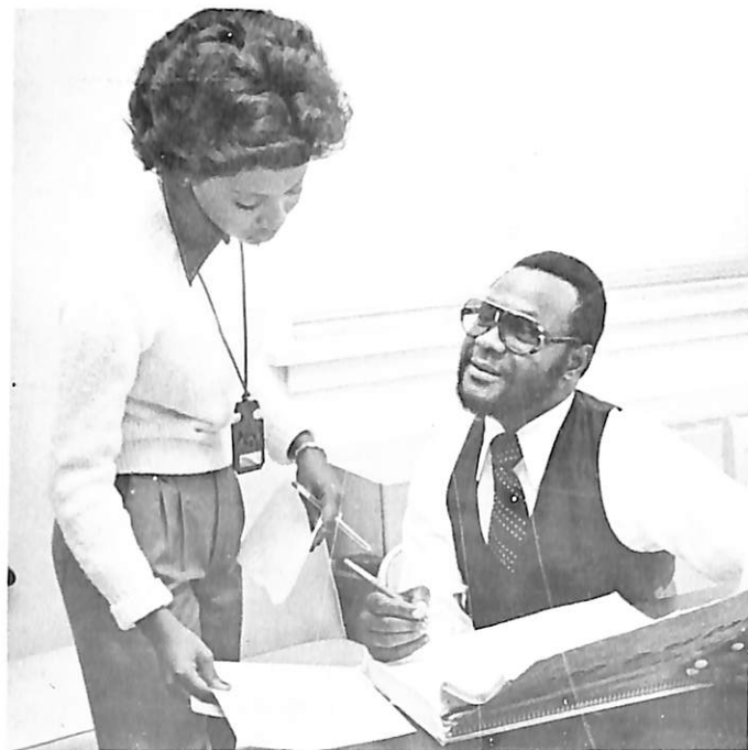
She picks up her voucher . . .