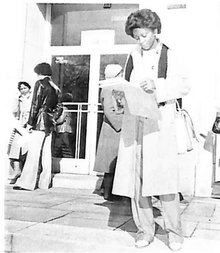
She checks schedule . . .