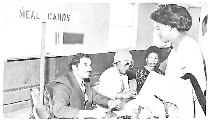
She picks up meal card . . .