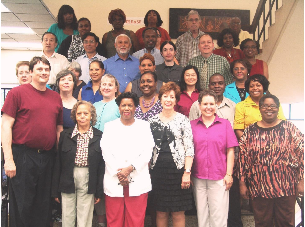
Library staff circa 2013